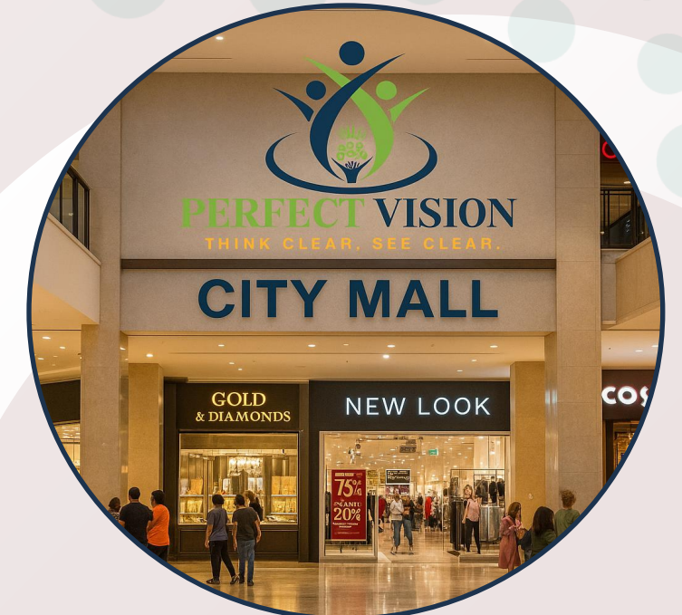
❖ CITY MALL Hotel & Restaurants